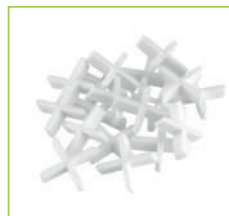
Tile Spacer (Available in 2, 3, 4, 5, 8 and 10 mm)