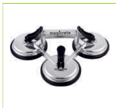
Heavy Duty Section Cup Triple Drum