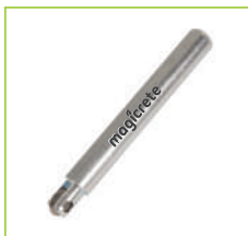
Pencil-type Cutter Wheel