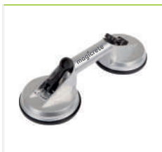
Heavy Duty Suction Cup - Twin Drum