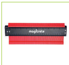
Plastic Tile Shape Template