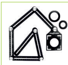
Hole Maker For Tiles